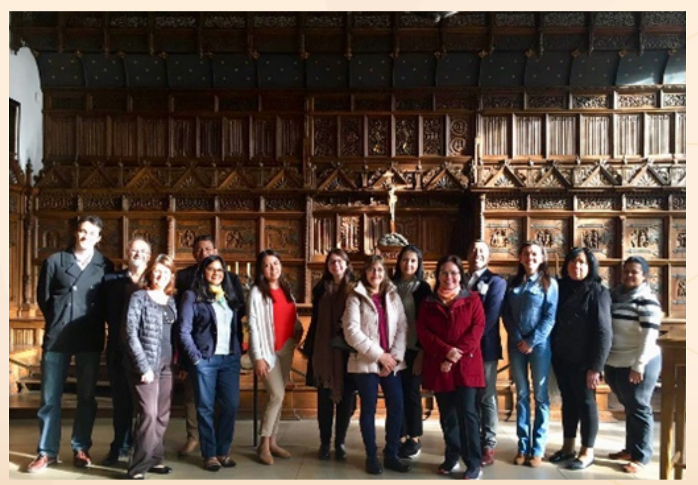
Tranfer Agency of Münster University Friedenssaal Münster, Münster's Town Hall, a Gothic building dating of Applied Sciences (TAFH) FH Münster from the mid-14th century with its high gable, is unique throughout Germany. In 1648, the Spanish-Dutch Peace Treaty - part of the Peace of Westphalia - was confirmed in the Hall of Peace.